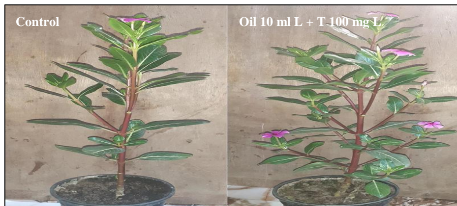
FIGURE 1. Effect of spraying with rapeseed oil and tryptophan on the number of vegetative branches in Periwinkle plants.